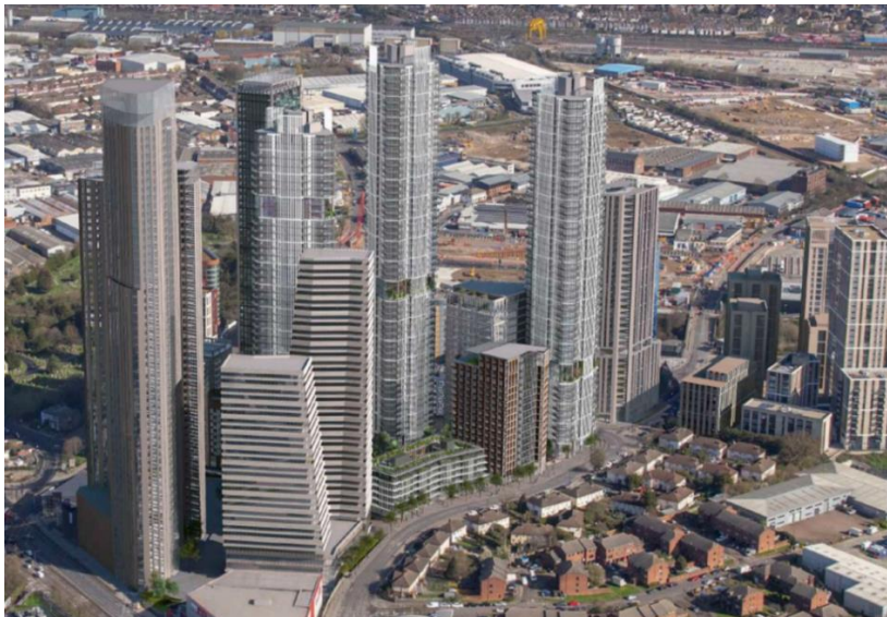
CGI image from architects Pilbrow & Partners showing the 'North Acton Cluster' were the Imperial scheme and other consented schemes to be built out.

A current application from Imperial College at One Portal Way involves a further 56 storey building, with outline permission sought for two further buildings of 'up to 50 storeys'. The published closing date for responses to OPDC on consultation on this application is January 10 th 2022. OPDC has chosen to retain this application for its own decision, rather than to delegate it to LB Ealing.